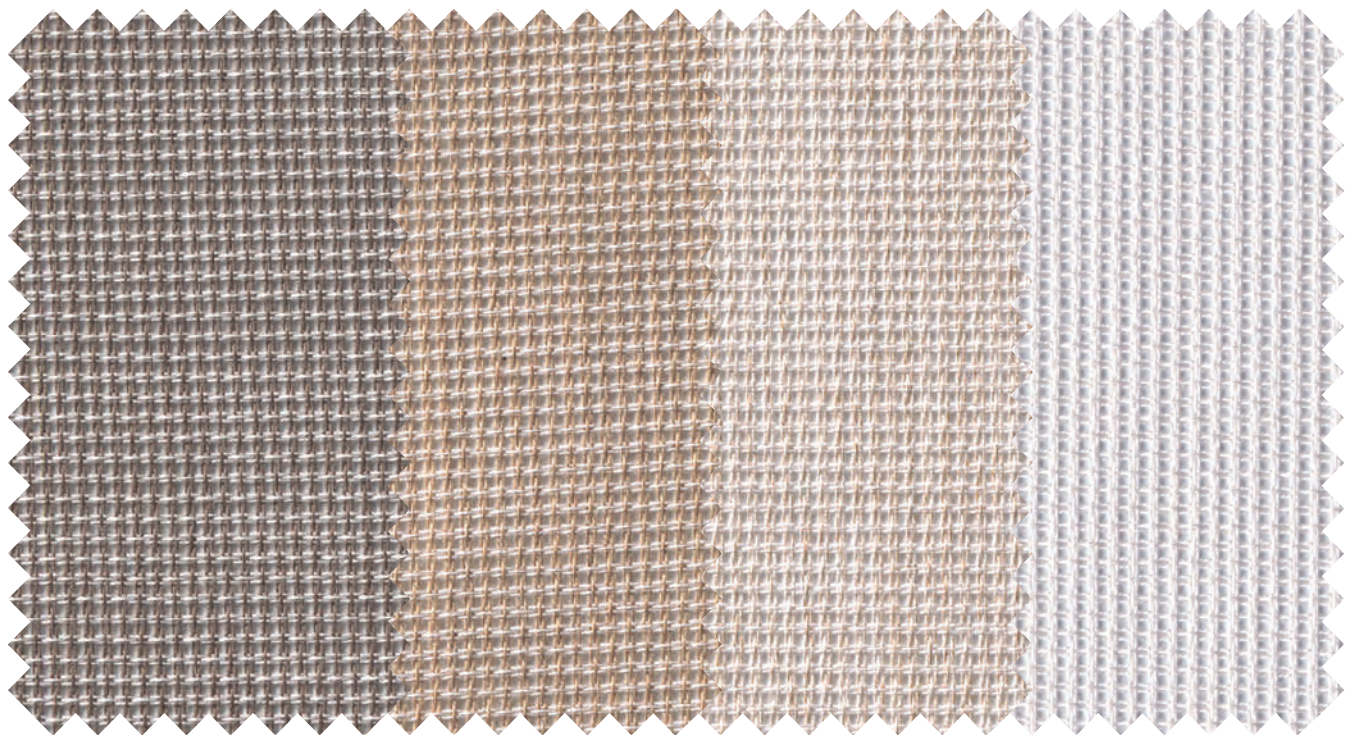
00788 Albis Stone